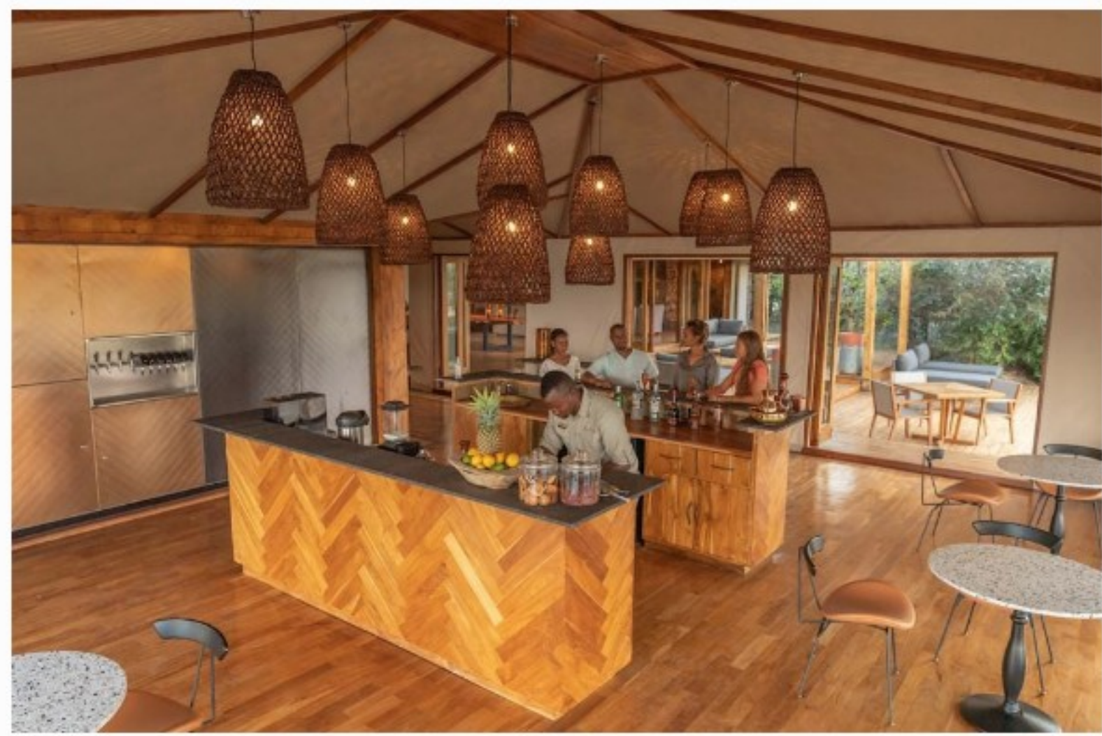
Asilia Africa has reopened the redesigned Sayari Camp with its own solar powered microbrewery. ASILIA AFRICA

UNICEF USA BRANDVOICE | Paid Program | Social Workers Protect Children From Violence In Vietnam