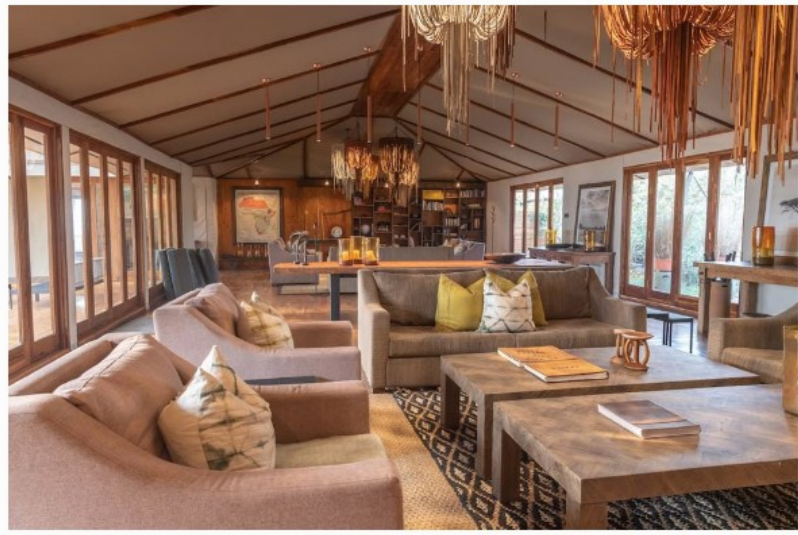
The new look Sayari Camp takes inspiration from the northern Serengeti's culture and environment.

Guests then stay in the camp's 15 spacious tented suites, one of which accommodates a family of up to two adults and three children. Each of these tents comes with a wraparound deck commanding views over the plains and they all draw on the distinct flat-topped Turner Hill in their design, with a color palette that reflects the patterns in its rocks.