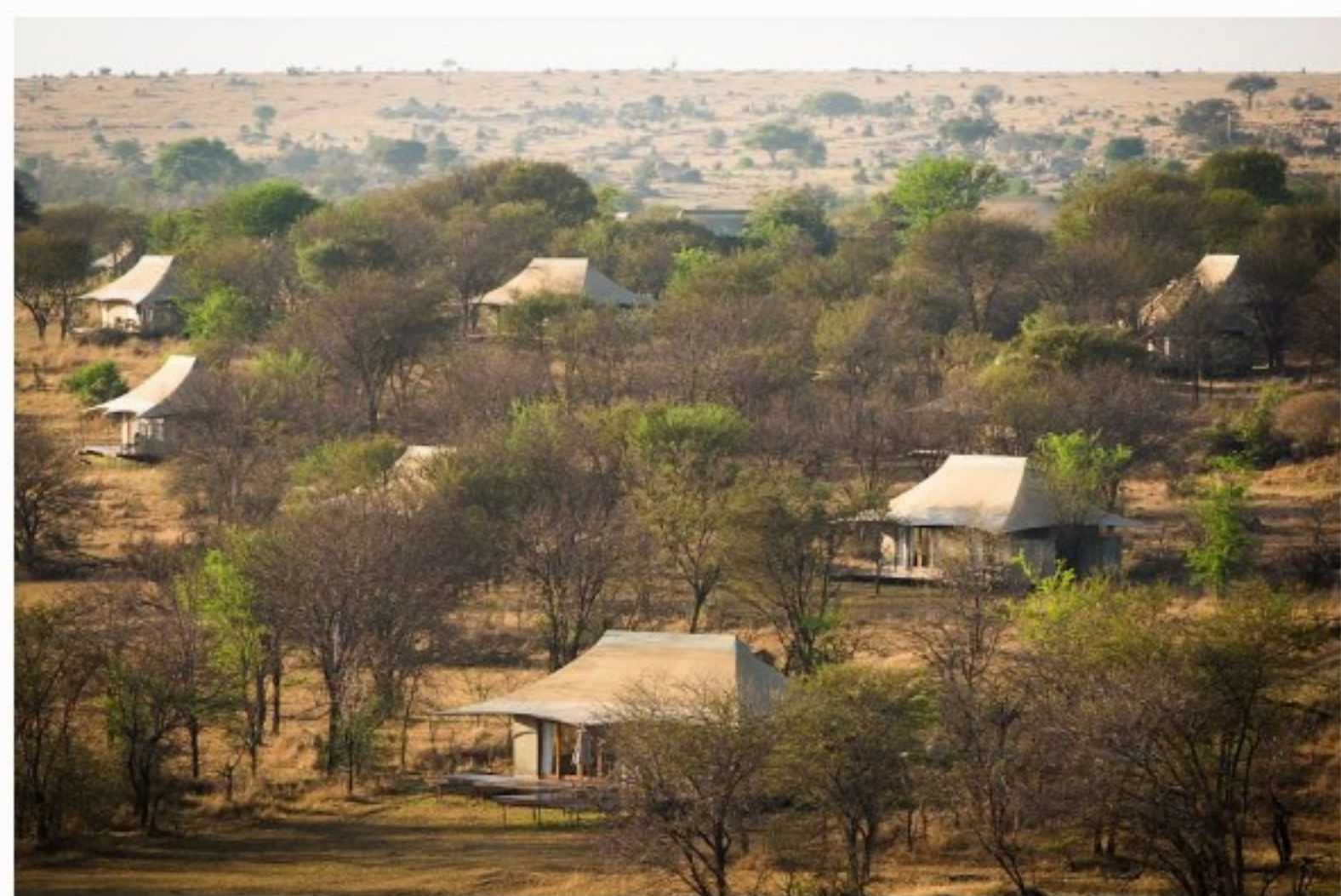
A view over Sayari Camp in the northern Serengeti.

The East African safari operator Asilia Africa has just announced the opening of its newly reimagined lodge, Sayari Camp in the northern Serengeti. In partnership with Scandinavian start-up Wayout, the camp is opening with the first-ever solar powered microbrewery in the bush.