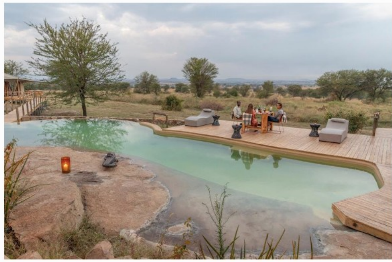
Asilia Africa has extended the rim flow pool offering a place to cool down at Sayari Camp.

The camp was originally set up as a traditional mobile camp before establishing a permanent location in 2009. This was the first permanent camp to put down roots in the northern Serengeti, subsequently securing long-term conservation of the region and creating employment opportunities in communities living on the park's boundary. The camp is now entirely Tanzanian run and, to date, the camp has donated US$121,500 to a local anti-poaching NGO.