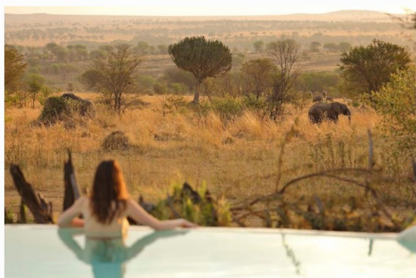
Sayari Camp commands view over the plains of the northern Serengeti.

Now encouraging guests to fly less and stay at single camps for longer, the safari operator created an environment that's conducive to longer stays at Sayari Camp. The new camp now has an enlarged swimming pool area, ideal for spending time spotting wildlife from the rim flow pool, along with a spa offering treatments with the eco-sensitive South African brand, Africology.